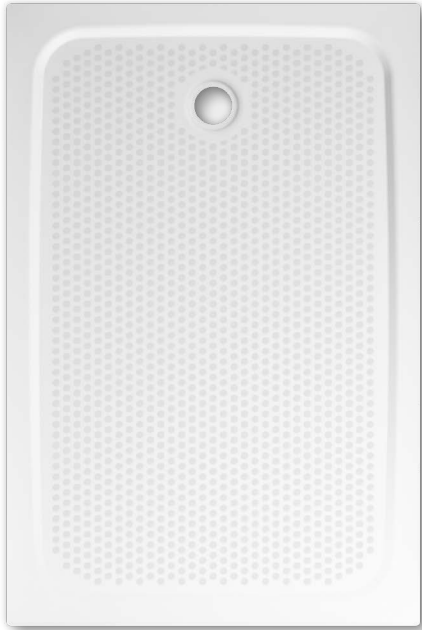
Illustration shows Model 2266